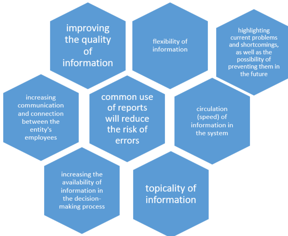
Figure no. 1. The advantages of implementing accounting reporting